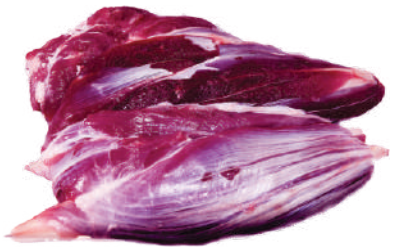
Sin & Shank